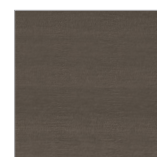
Coastal Grey Standard