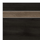
Ebony/ Timber Premium