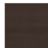
Woodland Brown Standard