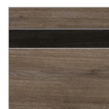
Timber/ Ebony Premium