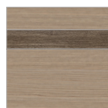
Aspen/ Timber Premium