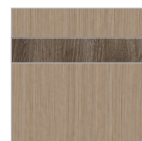
Aspen/ Timber Premium